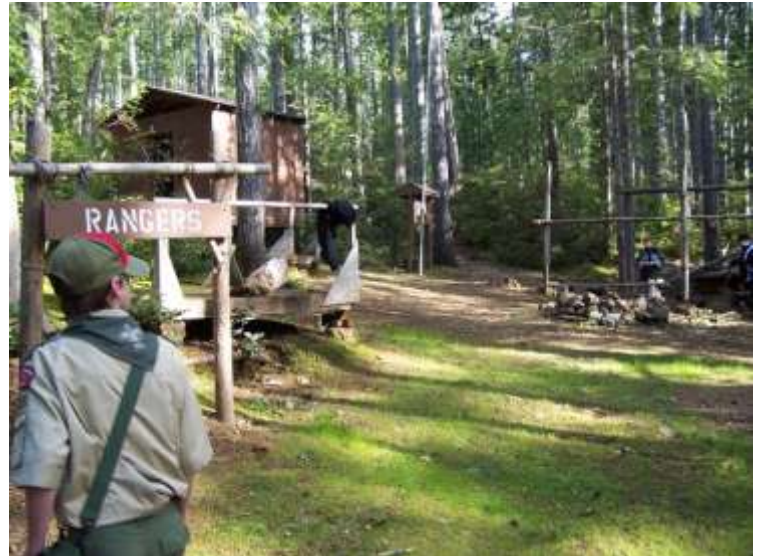
Home Sweet Home – away from Home More photos on pages 11, 13-14