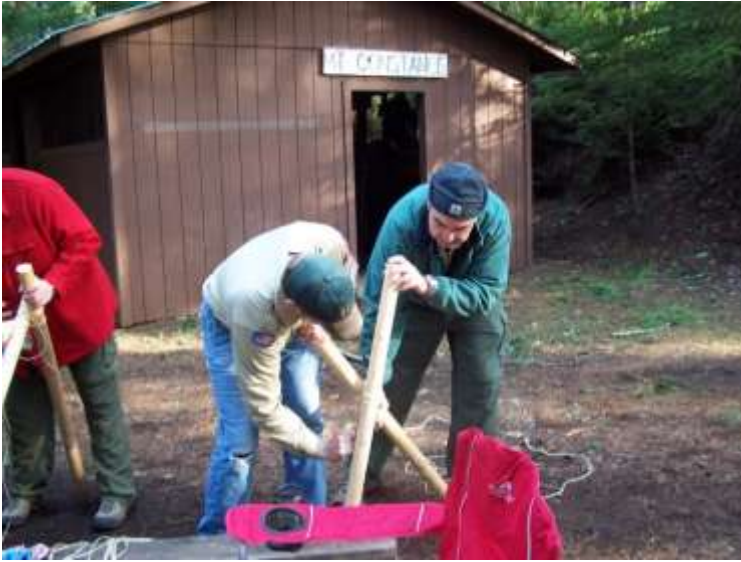
Learning to lash