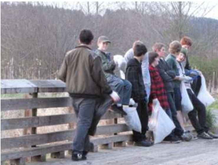
Getting close to the halfway mark in time so this looked like a great place to take a break. The bags are starting to fill up.