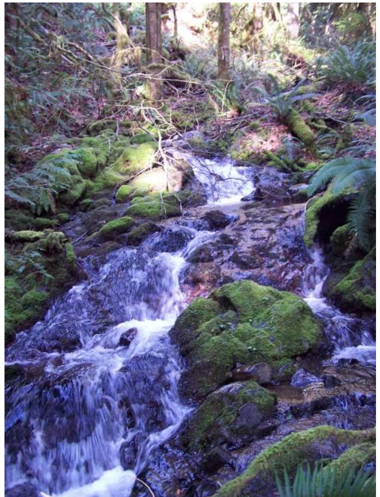
Is this one great place or what?