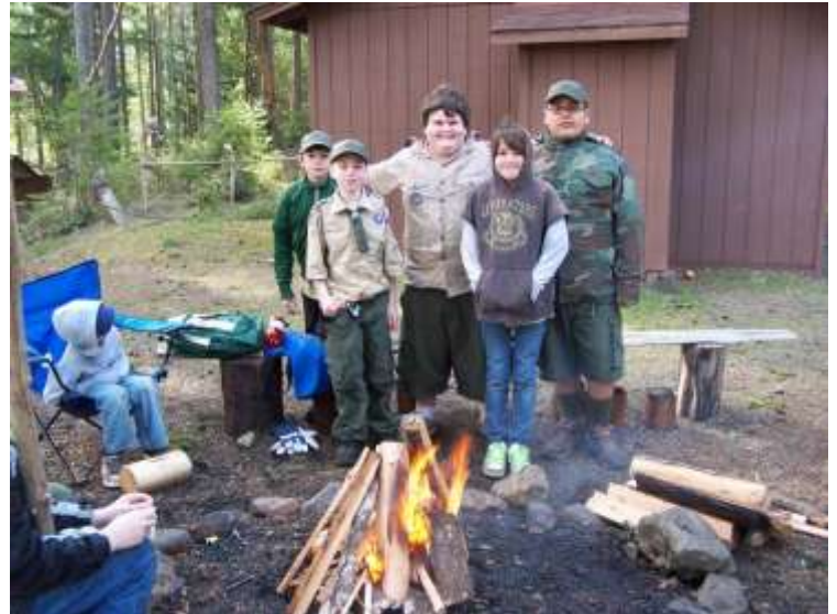
After learning fire safety and earning their fire chit, these scouts built their first fire.