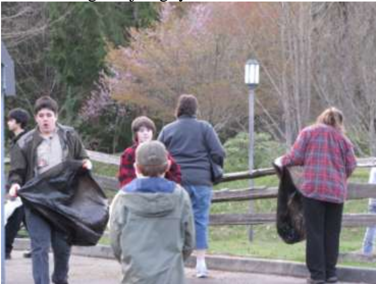
Starting out for the evening with empty bags