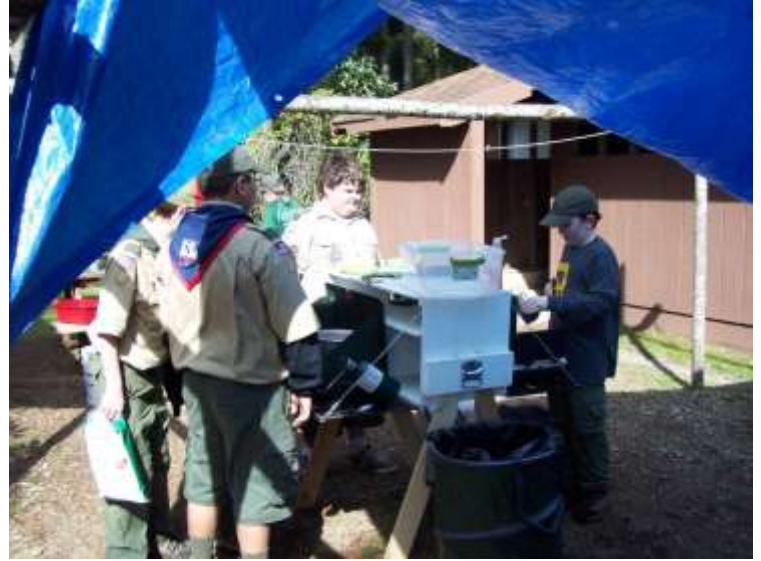
1508 Scouts starting dinner