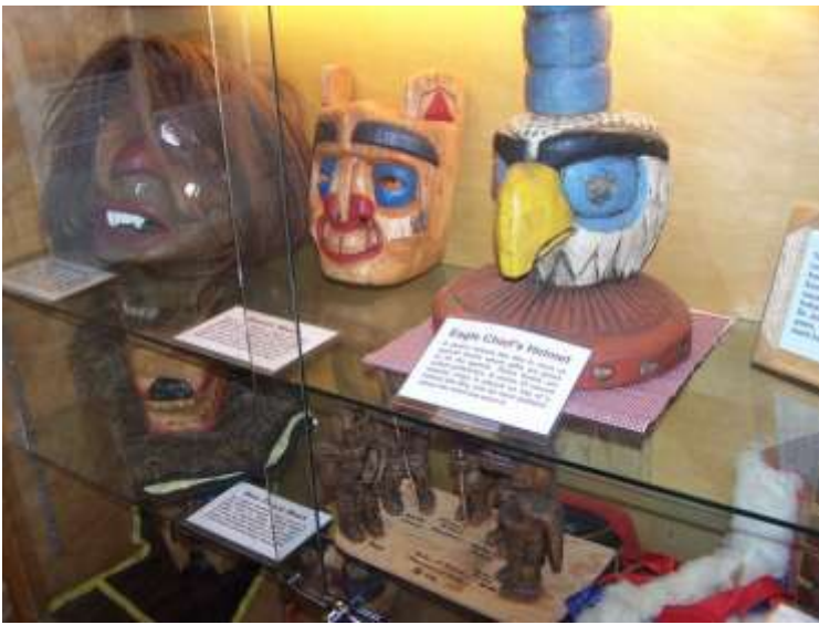
Camp Parsons Museum items