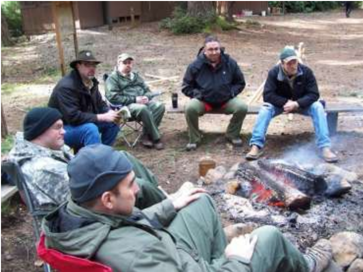
Plant ID and Wildlife class More photos on pages 11, 13-14