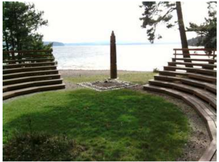
Looking out from the Fire Bowl